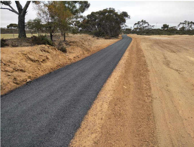
Above: New Path for Newdegate sporting area

On a sad note vandalism has been on the rise over the last couple of weeks with reports of unsocial behaviour occurring in Lake King and Lake Grace, if anyone spots any vandalism please contact the relevant authorities so we can stop this happening and clean up/fix any damage.