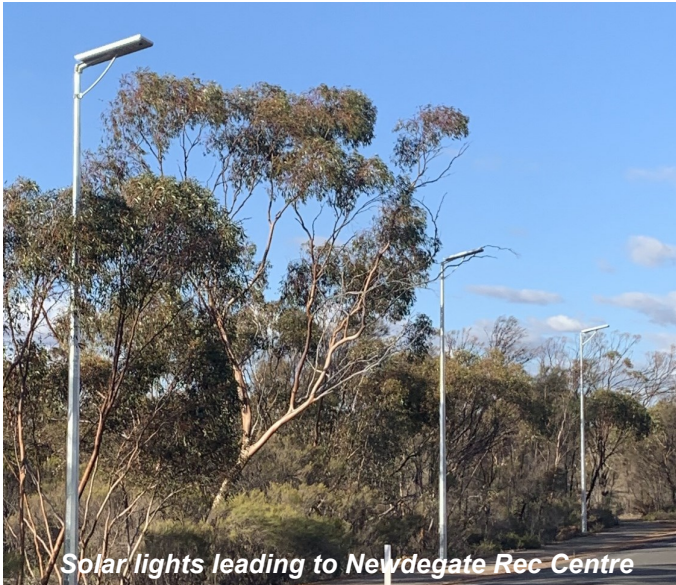
Solar lights leading to Newdegate Rec Centre