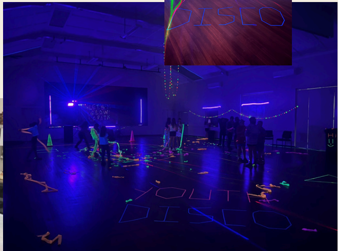
Youth disco in full swing

Youth Week WA 2024 is proudly supported by: