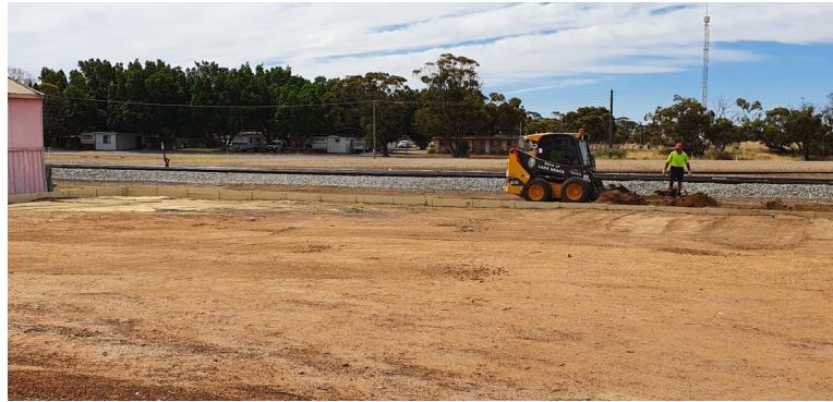
Main Street facelift has started. Watch this spot, some changes are coming