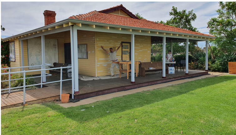
Lake Grace Visitor Centre is having it's first facelift since 2004 and the opening in 2005.