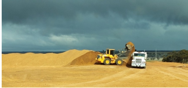
Above: Roads crew at work