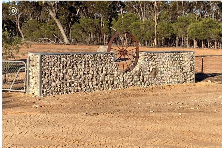
Above: Varley Cemetery Entrance