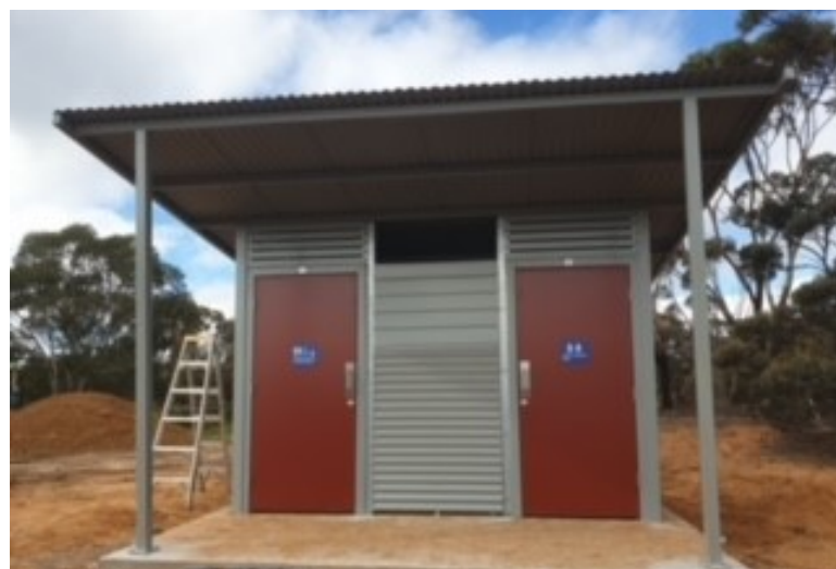
Above: We now have new public toilets near the Lake King BP fuel pumps for people travelling North / South who couldn't find the toilets near the Lake King store. No more deposits in the bush.