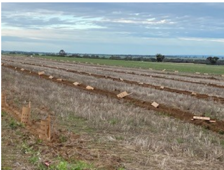
Above: Trees planted on the eastern side of the new industrial area.