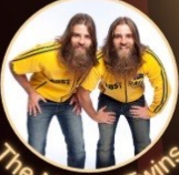
The Nelson Twins