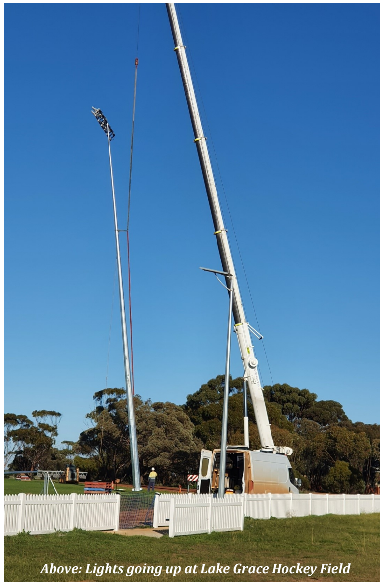
Above: Lights going up at Lake Grace Hockey Field