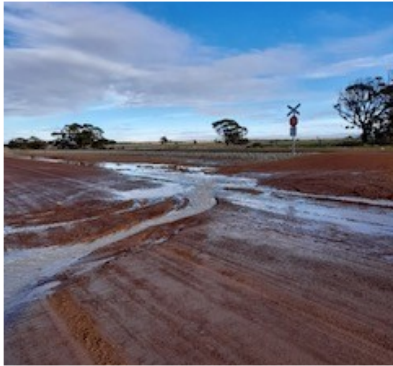
Above: This is why we request heavy vehicles do not go onto our gravel roads until after it has soaked in.

Builders are currently onsite completing these works.