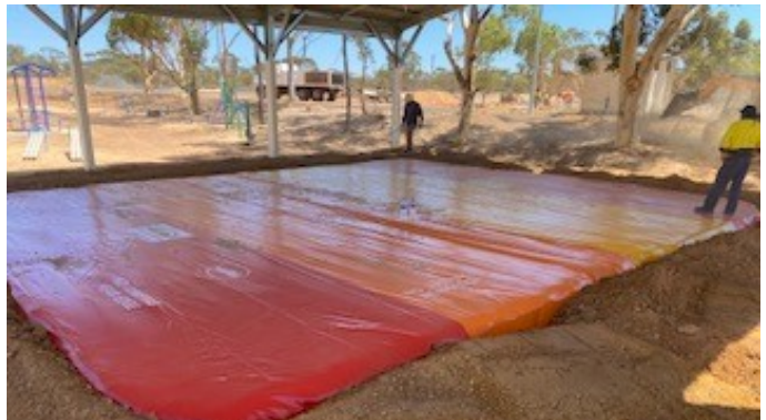
Above: Installation of Jumping Pillow at Newdegate Sporting Precinct.