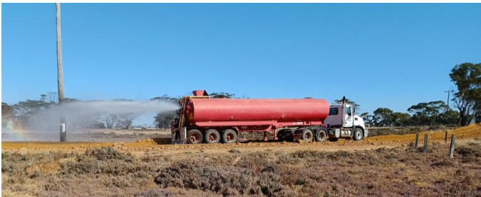
Above and below: Slarke St road works

The Newdegate Maintenance Grader has carried out grading on: