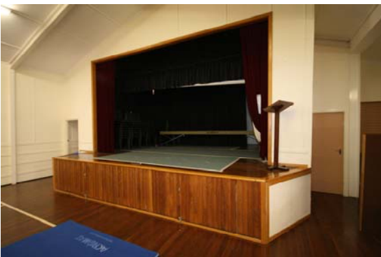
Stage in Lake King Hall