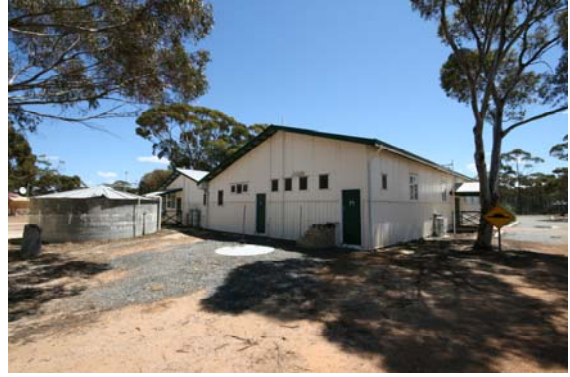
Rear of Venue