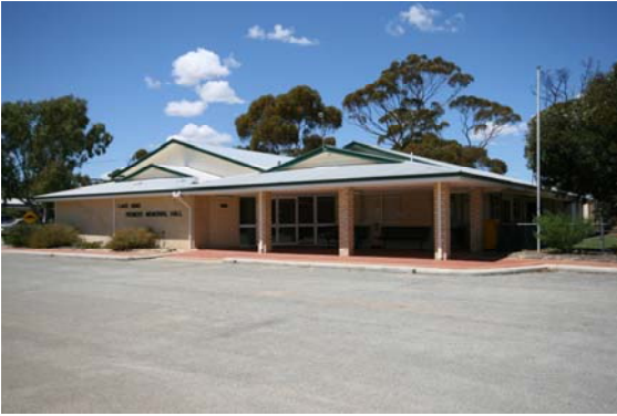
3D View of front of venue