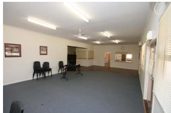
Supper Room (main hall on left through walkthrough arch)