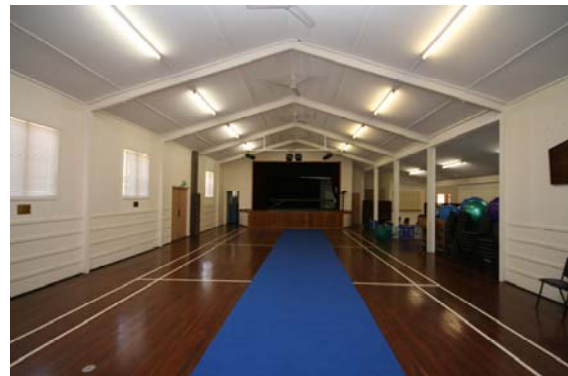
Lake King Hall - looking towards stage (from entry)