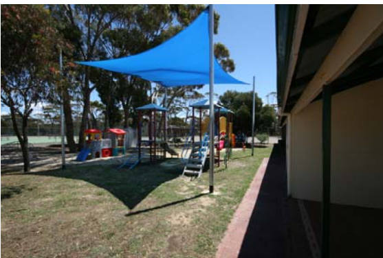
Side of venue including playground area