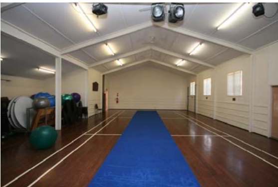
Lake King Hall - looking towards main entry end of hall (from stage)