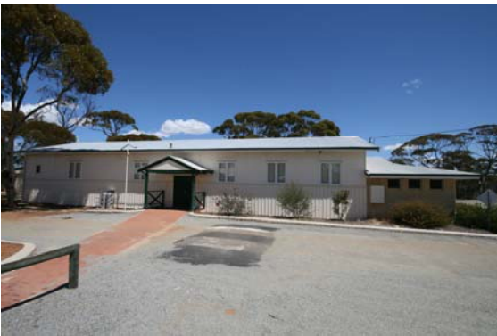
Side of Venue (Load in Truck Access) (& plenty of truck/bus/company parking)