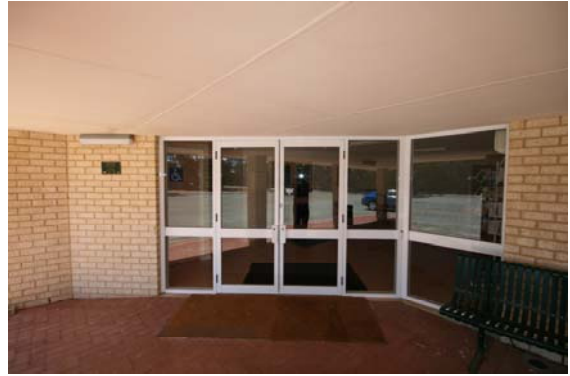
Main Entry Doors to Venue