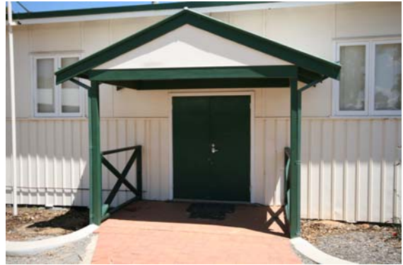
Load in access at side of venue (through double doors)